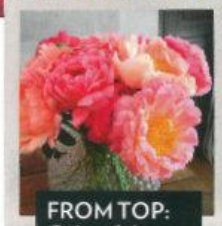
FROM TOP: Colourful Stockholm; perfect peonies at Ett Hem

and offers guests an experience that is quite unlike anywhere else. And rather wonderful. (No wonder the married A-list actors who were there during our stay had booked in with all their kids – it's that kind of place.)