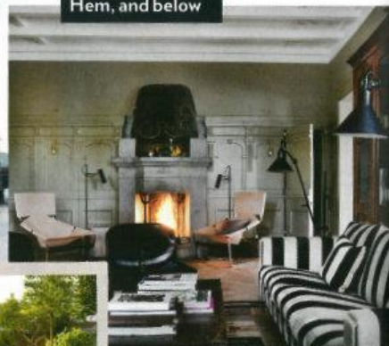
The stunning Ett Hem, and below